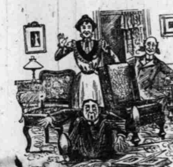
As to Prices of My Goods The Bottom has Dropped Out