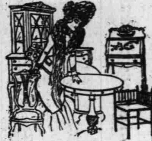
Making a Wise Selection

Has the most useful and tasty gifts for Xmas and bridal occasions.