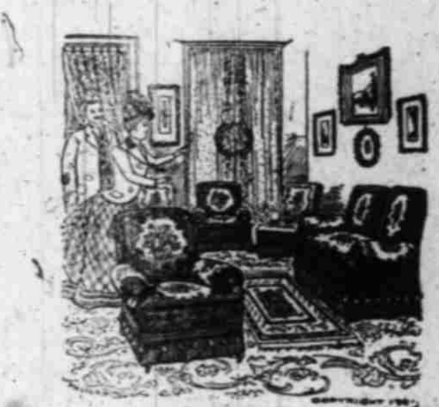
Your parlor is O. K. when furnished at A. T. BARNES' Furniture House.