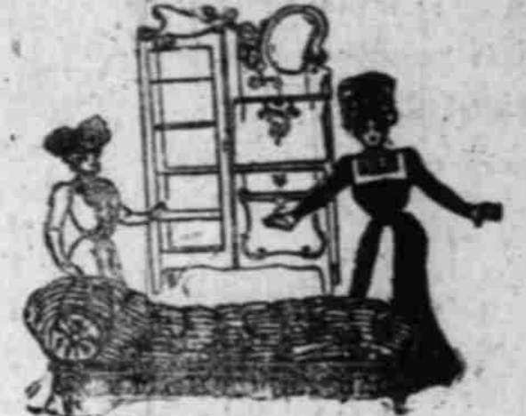
Something You Will Admire.