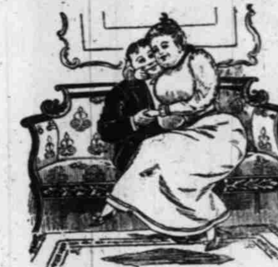
The Xmas Present from A. T. BARNES' Furniture House is sure to please.