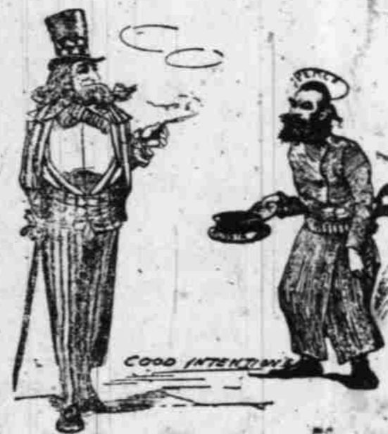
Uncle Sam to Filipino: "Do as I tell you, buy your furniture at A. T. BARNES' Furniture House."