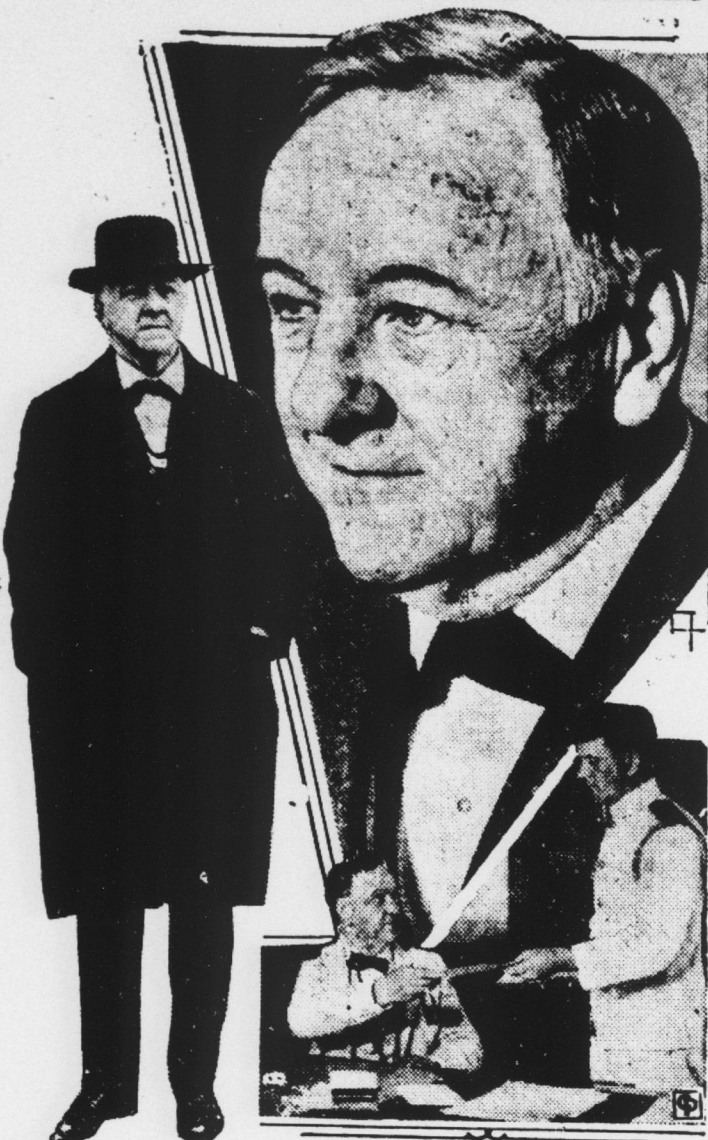
Josephus Daniels, former secretary of the navy, injured in an automobile crash in Georgia, is recovering rapidly and is returning to his home in Raleigh, N. C. Photos show, left, Daniels, in 1926, back in private life as publisher of his paper in Raleigh, N. C.; upper right, a recent photo; lower right, as secretary of the navy in 1918, with an aide, during the World war.