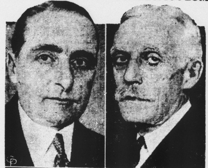
Secretary of the Treasury Andrew W. Mellon, approaching his seventy-seventh birthday, has accepted the highest post in the American diplomatic service—the ambassadorship to Great Britain. Ogden L. Mills, left, undersecretary of the treasury and ex-congressman from New York, will step into Mellon's shoes in the cabinet. Mellon succeeds Gen. Charles G. Dawes, head of the new Reconstruction Finance corporation.

Jap Bluejackets Enter American Presbyterian Mission Despite Official Warning