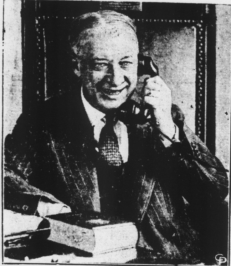
Alfred E. Smith