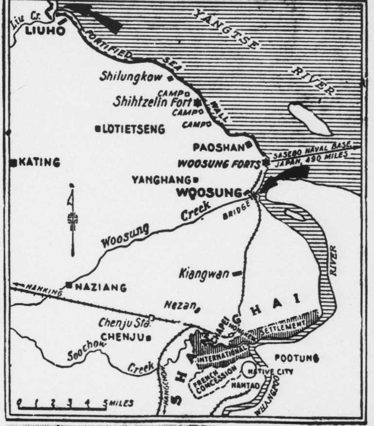
This map shows the area around the famous Woosung forts near Shanghai, where Chinese troops, despite heavy bombardment and troop concentration, have thrust back Japanese attacks in attempts by the latter to circle the entrenched Chinese army. The district is heavily fortified by the Chinese. In the photo below are shown field mortars of the type used by Chinese in repelling the invaders. The guns are used to hurl heavy bombs at an angle designed to land them in the opposing trenches.

Hostilities Will Cease For Short Time To Allow Trucks To Go In For Residents