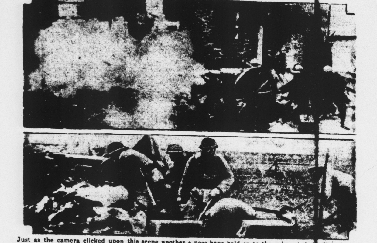
Just as the camera clicked upon this scene another shell went on its errand of destruction into battered Chapel. This is one of the Japanese mountain guns that have been hammering at the Chinese positions in an attempt to dislodge the poorly-equipped, but gallant defenders. Despite the terrific pounding of hundreds of guns like the one shown here, the Chinese have held on to the ruins of their city. Lower photo shows one of the batteries that have been bombarding the Woosung forts in action. (Times)