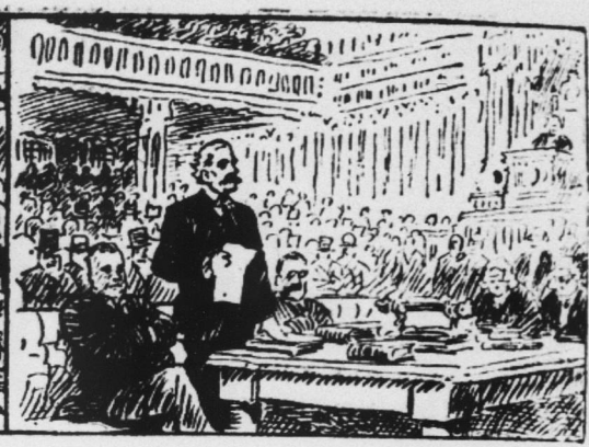
Today he is the head of the British government and upon him is centered the hopes of the nation for delivery from its crushing problems.