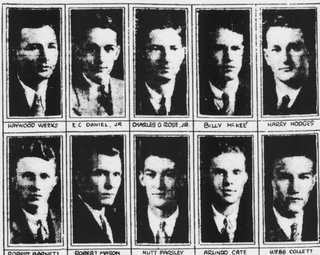
Chapel Hill, April 25.—Pictured above are 10 students who have just been elected as leaders of the outstanding organizations at the University of North Carolina for the ensuing year. They formally inducted into office at a chapel ceremony held in Memorial Hall last week.