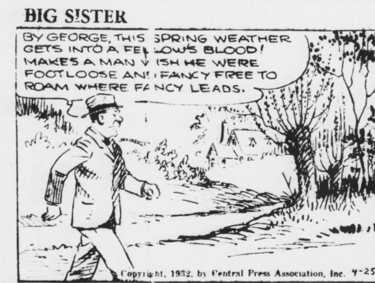
BIG SISTER BY GEORGE. THIS SPRING WEATHER GETS INTO A FEW LOWS BLEED! MAKES A MAN VISH HE WERE FOOTLOOSE AND FANCY FREE TO ROOM WHERE FANCY LEADS.

Play Billiards for Health and Recreation