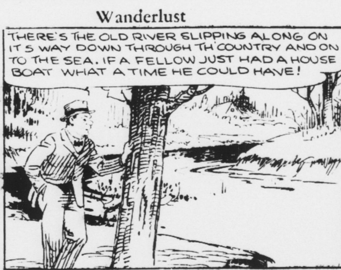
Wanderlust THERE'S THE OLD RIVER SLIPPING ALONG ON IT'S WAY DOWN THROUGH TH' COUNTRY AND ON TO THE SEA. IFA FELLOW JUST HAD A HOUSE BOAT WHAT A TIME HE COULD HAVE!