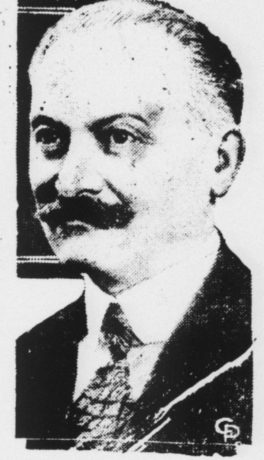
Albert LeBrun today was elected President of France at a joint session of the French Senate and Chamber of Deputies. He succeeds the assassinated Paul Doumer.