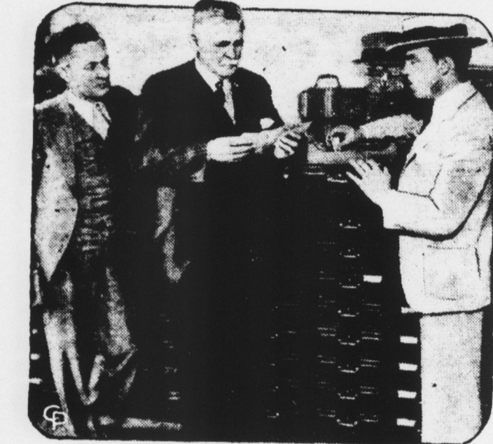
Dr. John F. (Jafsie) Condon, aged educator who has spent much of his time recently in connection with the Lindbergh kidnaping, is shown at state police headquarters at Trenton, N. J., scrutinizing photos on file there in an effort to find some clue to the identity of the man he paid $50,000 in ransom without avail.