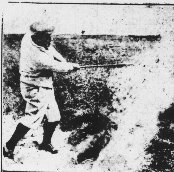
Though you cannot see the ball in this picture, it is on its way out of the hole in which Gene Sarazen found himself during the first round of the British open golf championship at Sandwich, Eng., recently. He blasted his way to victory with a record score, marking the ninth time that his title has come across the Atlantic to America. Sarazen is a New Yorker, you know.

he won his twelfth game of the season as the Cleveland Indians pounded Boston to a 9 to 3 win.