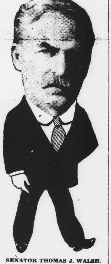
SENATOR THOMAS J. WALSH.