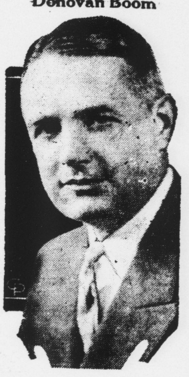
Donovan Boom Col. William J. Donovan's friends are booming him for the Republican gubernatorial nomination in New York. He was commander of the "Fighting 69th" during the World war and later was assistant United States attorney general. Donovan was prominently mentioned for the attorney generalship in the Hoover cabinet.