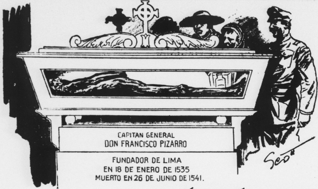
CAPITAN GENERAL DON FRANCISCO PIZARRO FUNDADOR DE LIMA EN 18 DE ENERO DE 1535 MUERTO EN 26 DE JUNIO DE 1541.

THE REPUTED MUMMY OF FRANCISCO PIZARRO, THE CONQUEROR OF PERU, LIES IN A CASKET IN THE CATHEDRAL AT LIMA—