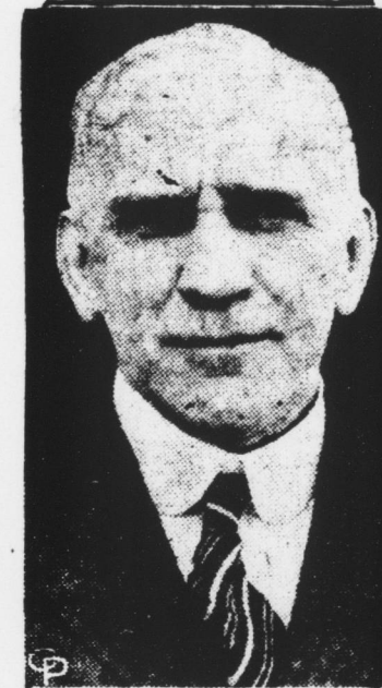
Former Congressman Franklin W. Fort of New Jersey has been named chairman of the board of directors of the new Federal Home Loan Bank system by President Hoover. One of the first tasks of the board will be to determine in what cities home loan banks are to be established.