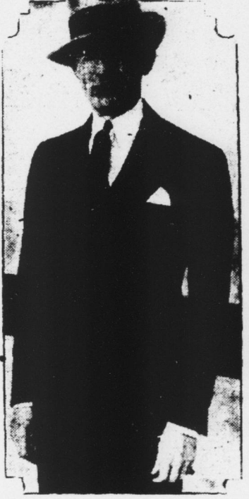
Here is former Mayor Walker as he sailed from New York for Europe on the S. S. Conte Grande. Now all Gotham is asking if the popular Jimmy really intends to run for re-election. Walker stated his surprise sailing was due to "accidental orders."