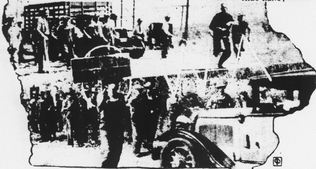
Scenes in Iowa, where farmers' strike began

This is the first of a series of dispatches clarifying the farm problem.