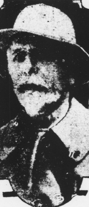
Sir Basil Zaharoff

Sir Basil Zaharoff, wealthy An- glo-Greek financier, above, en- tered the international melodrama which has involved Samuel Insull, deposed utility king, when Zaharoff's name was found in one of the coded cablegrams sent to In- sull from Chicago to two Euro- pean cities. Police of Athens, where Insull is held, thought the one-time multi-millionaire may have been urged to see Zaharoff in the hope that his influence might enable Insull to avoid ex- tradition from Greece.