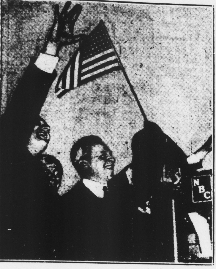
For a moment a political meeting took on an appearance of an after-the-rally demonstration as admirers showered Governor Franklin D. Roosevelt and his co-speaker, Governor Joseph Ely of Massachusetts, with confetti, when the Democratic candidate made a campaign address at Boston. The targets of the confetti-throwers seem to enjoy the experience, something new at a political rally.