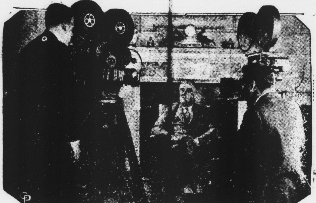
The man who now shares the public spotlight with President Hoover is shown at the executive mansion in Albany as he voice and features are recorded for sound newsreels. To be sure he is none other than Gov. Franklin D. Roosevelt of New York, the Democratic nominee.