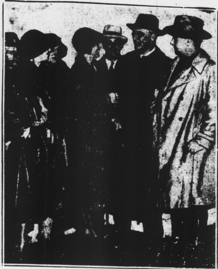
It is given to only one in many, many millions to return to his home town with the Presidency of the United States in his pocket...