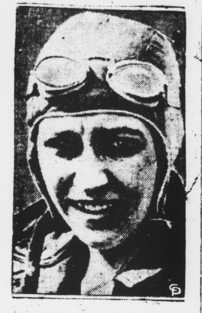
Cape Town, Union of South Africa, Nov. 18. (AP)—Amy Johnson, flying from England, landed here at 1:30 p. m.; Greenwich time (8:30 a. m. EST) today, clipping nearly eleven hours off the speed record held by her husband, J. A. Mollison.

Last March, Captain Mollison made the trip in four days, 17 hours and 19 minutes. His wife's time was four days, six hours and 55 minutes, or ten hours and 21 minutes faster than his.