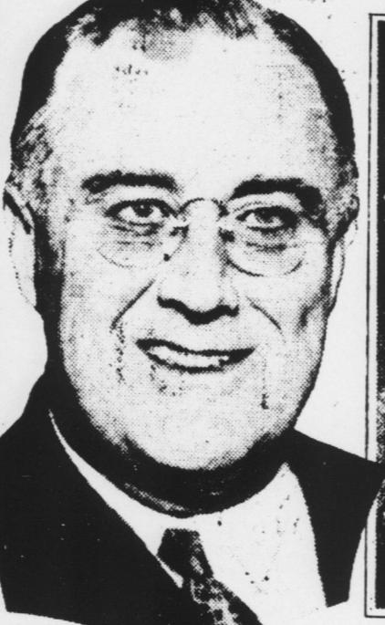
Franklin D. Roosevelt Democratic president to win a majority of the total vote of the nation since Franklin Pierce, in 1852—exactly 80 years ago. Samuel Tilden received an absolute majority (51 per cent) of the