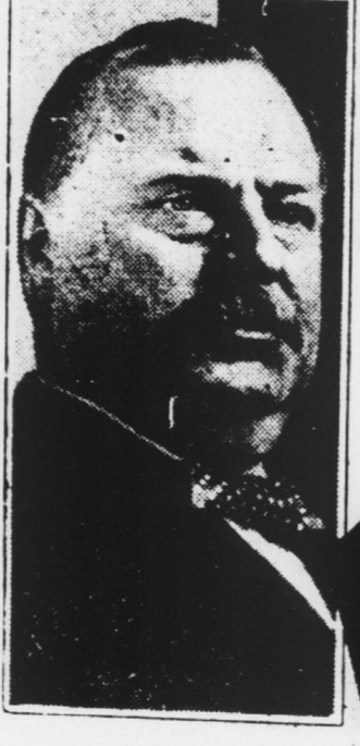
Grover Cleveland Franklin D. Roosevelt will be the third Democratic president since the Civil War. The other two were Grover Cleveland, of New York, and Woodrow Wilson, of New Jersey. Roosevelt is the first