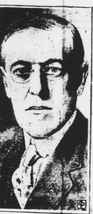
Woodrow Wilson popular vote in 1876, but lost the presidency to Rutherford B. Hayes as a result of an adverse decision of the electoral commission. Democrats still assert Tilden was deprived of his victory.