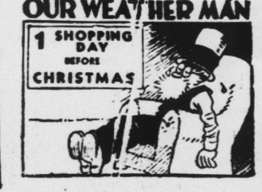
OUR WEATHER MAN 1 SHOPPING DAY BEFORE CHRISTMAS