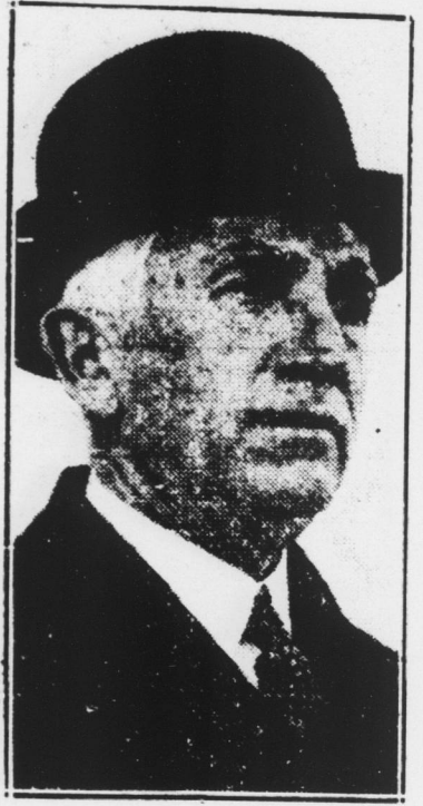
Norman Davis, distinguished American statesman, homeward bound for the New Year, is shown as he arrived at New York from Europe on the S.S. Manhattan.

Washington, Dec. 28.—(AP)—A definite refusal to economize beyond the recommendations of the appropriations committee showed itself in the House today as it pushed on toward early passage of the big agriculture supply bill.