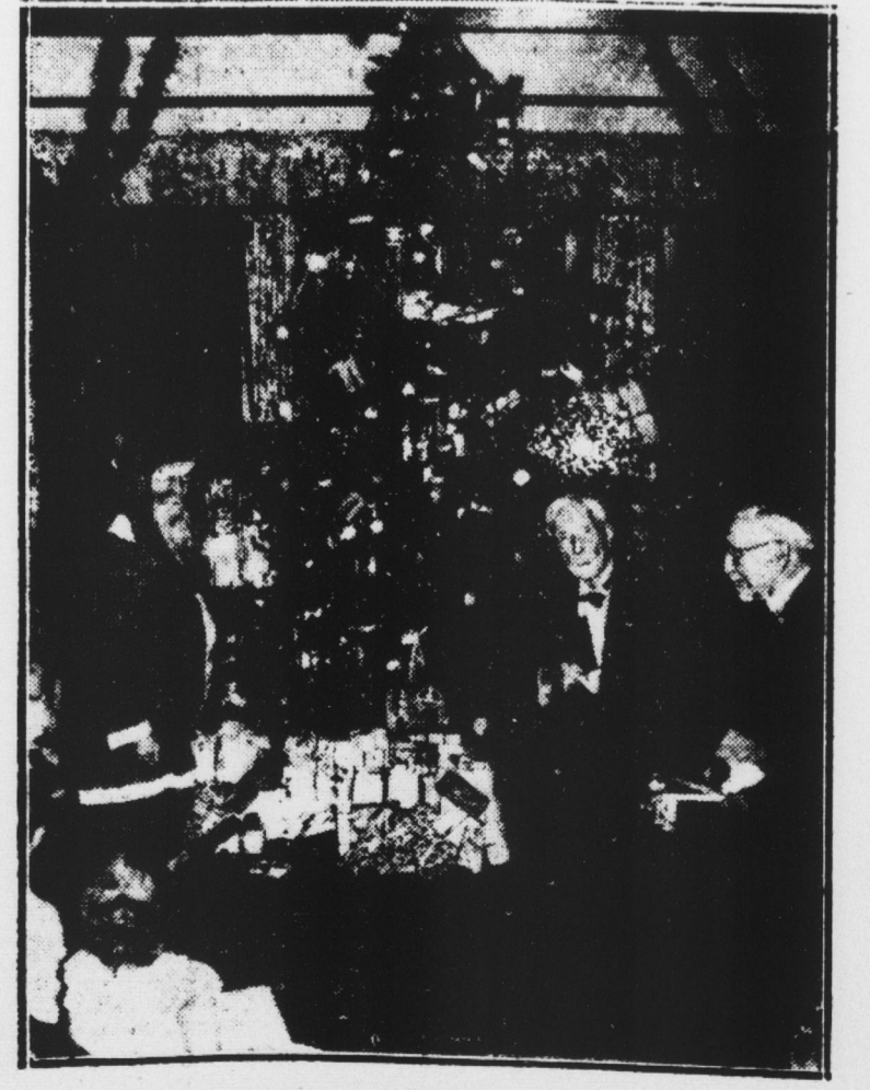
Here is John D. Rockefeller (center) as he assisted Santa Claus at the annual Christmas party in the Rockefeller winter home at Ormond Beach, Fla. The 98-year-old Oil King was host to thirty old friends and neighbors including several children who received gifts from Santa himself.