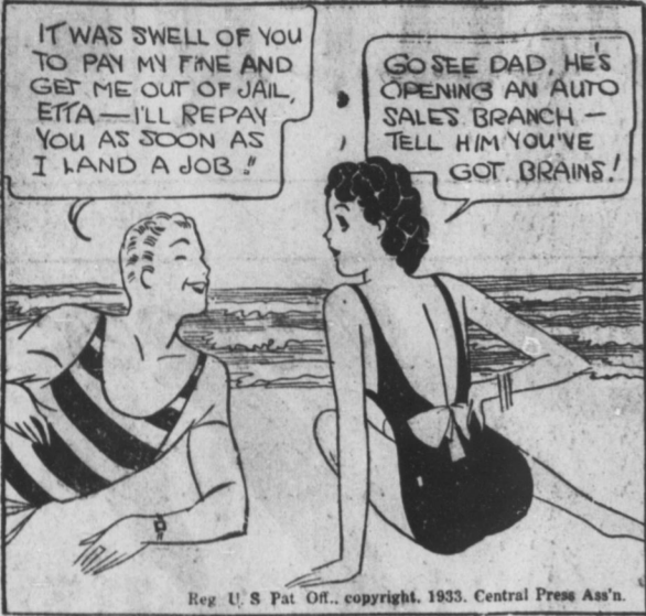
Reg. U. S. Pat. Off.