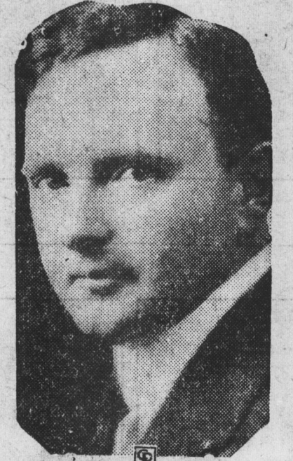
Harry F. Byrd

Former Governor Harry F. Byrd, of Virginia, was yesterday appointed by Governor John Garland Pollard, his successor in office, as United States Senator from that State to succeed Senator Claude A. Swanson, who has been appointed secretary of the navy in the Roosevelt cabinet.