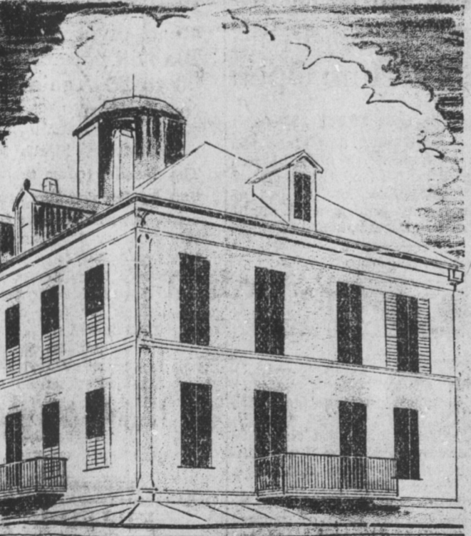
THE HOUSE THAT WAS BUILT IN NEW ORLEANS AS A REJUGE FOR NAPOLEON BONAPARTE - NAPOLEON DIED IN EXILE ON ST. HELENA BEFORE THE PLOT TO RESCUE HIM WAS CONSUMMATED