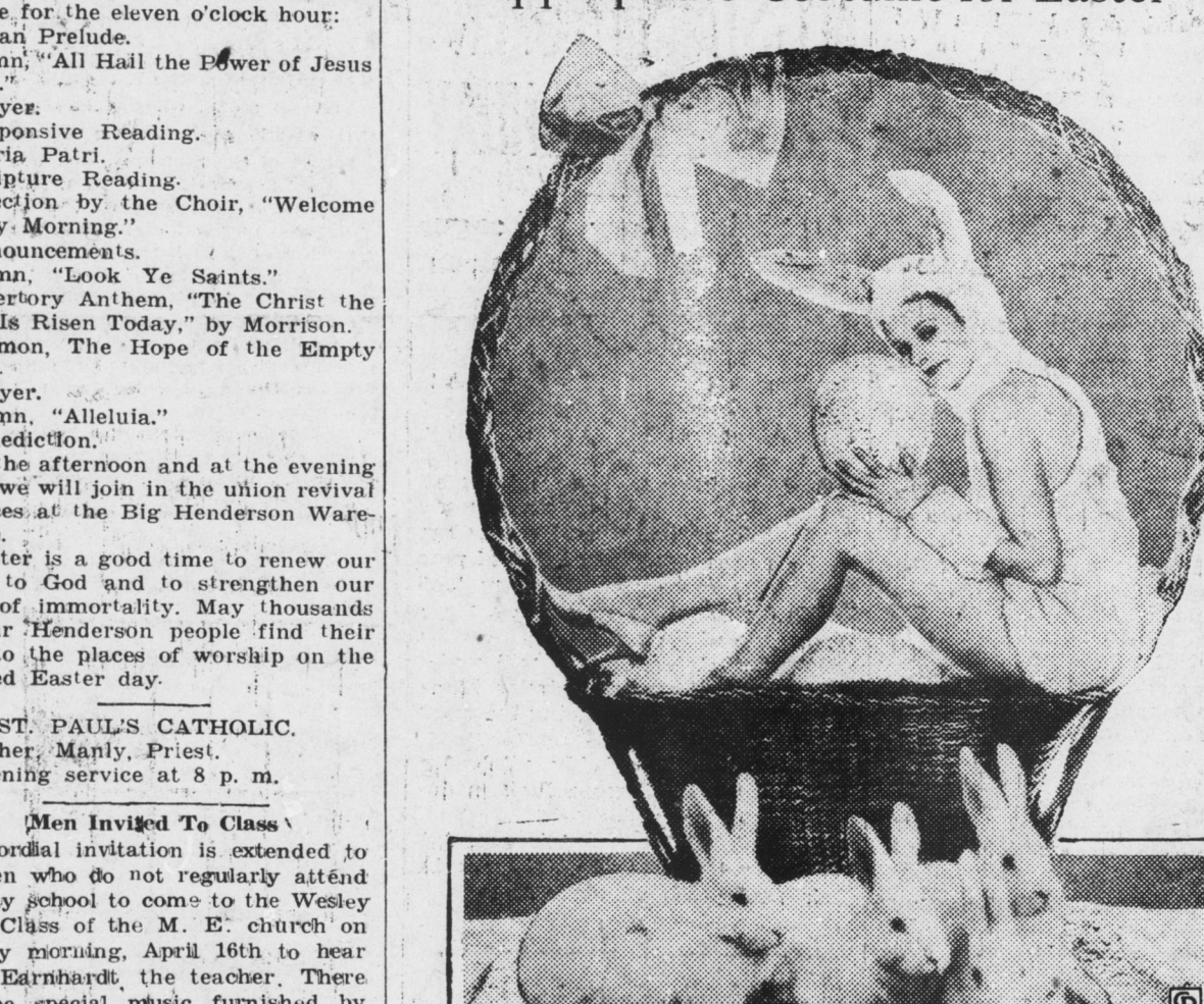
As the Easter rabbit soon is to make its appearance, Miss Heather Angel of New York, dons a rabbit costume so that her friend "Rabbit" will feel more at home. To prove it observe the white bunnies lingering around waiting for Easter egg day.