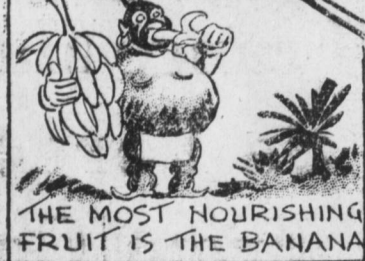
THE MOST NOURISHING FRUIT IS THE BANANA