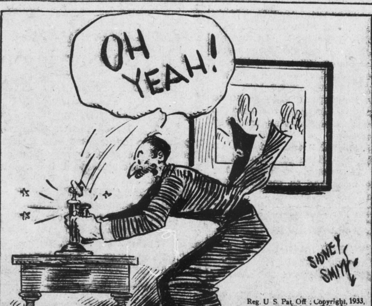
Reg. U. S. Pat. Off. Copyright, 1933, by The Chicago Tribune