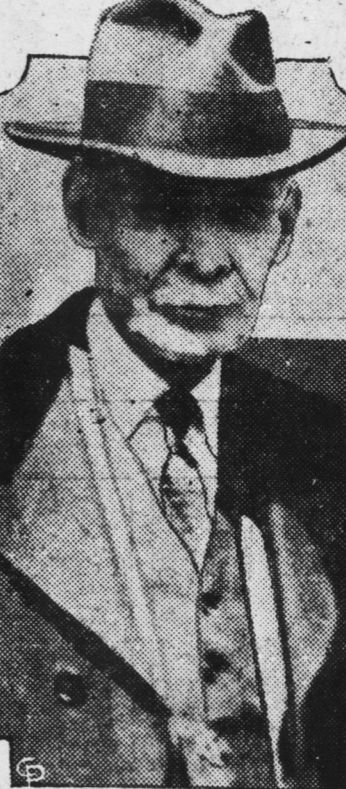
Andrew J. Volstead

This is the first photograph of former Congressman Andrew J. Volstead, father of prohibition, taken in several years. He is shown leaving his office in St. Paul. The fact that Volstead has been in poor health for months has had a tendency to increase his dislike for newspapermen and photographers.