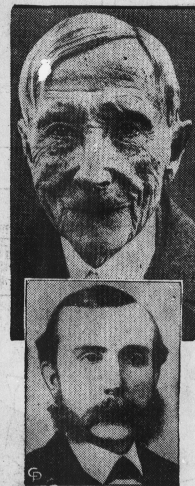
John D. Rockefeller

John D. Rockefeller, multi-millionaire oil king, celebrates his ninety-fourth birthday July 8. The gentleman in whiskers, above, is John D., as he looked in 1875. Contrast this with his latest photo at top.