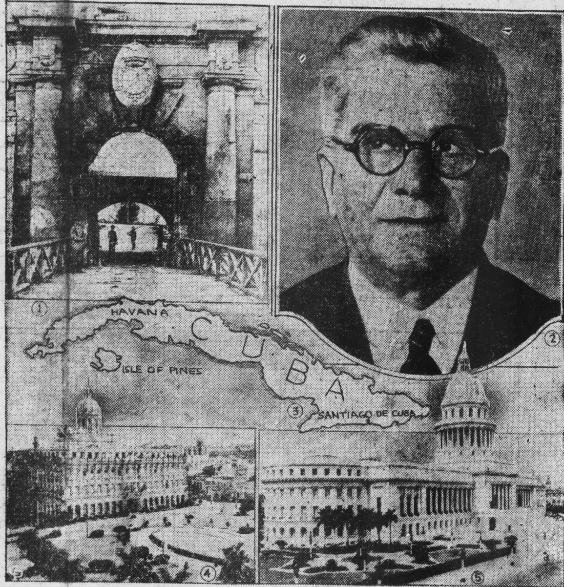
Seriousness of the Cuban situation has been enhanced by the arrival of additional troops to attempt to restore order in Havana by bayonet rule, following the