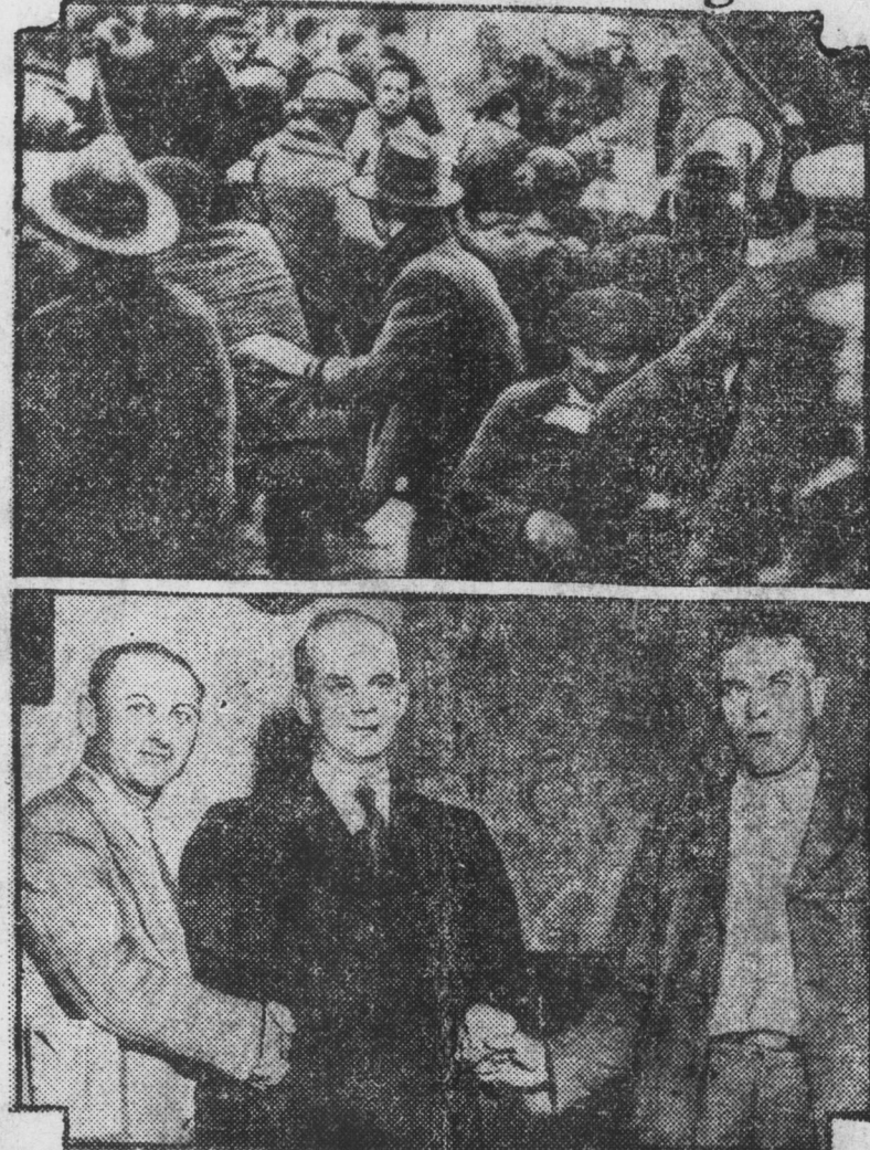
Bullets and clubs were used when 400 strikers battled 100 employees of a steel mill in the Pittsburgh district.