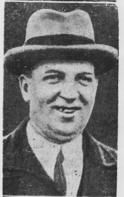
John McGovern Flinging epithets that shocked the august gathering, John McGovern, Labor Member of Commons, made unprecedented verbal assault on George V as the king completed traditional state speech in House of Lords, opening Parliament.