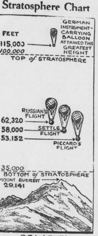
How science has conquered the stratosphere, far beyond the earth's atmosphere, is graphically illustrated in the above chart...

Washington, Nov. 23.—(AP)—Maxim Litvinoff heads for Moscow today with personal tidings of America's new friendship for the Soviet Union.