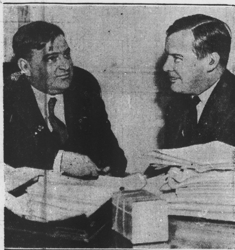
Mayor LaGuardia and Joseph McKee. Election battles seem to have been relegated to the dim and distant past in this friendly scene between Mayor Fiorello H. LaGuardia and Joseph V. McKee, one of his opponents in New York's Mayoralty race. They were pictured when McKee made a congratulatory call at City Hall.