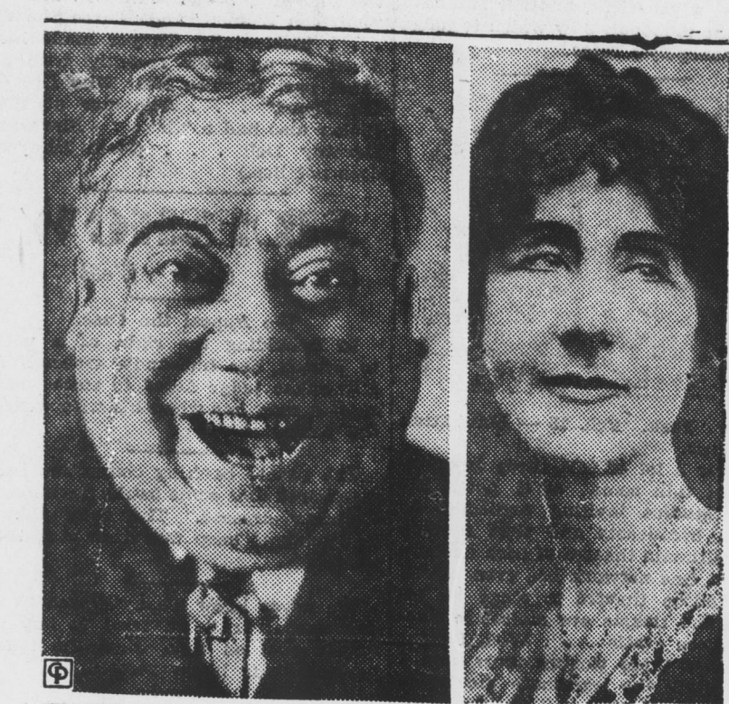
John Bunny Twenty-one years ago Remember rolly-polly John Bunny and his slim wife, Flora Finch, sophisticated comedians of the screen.

who enjoyed so much popularity in the pioneer film days? Their two-reelers were the best comedy of the screen before the war.