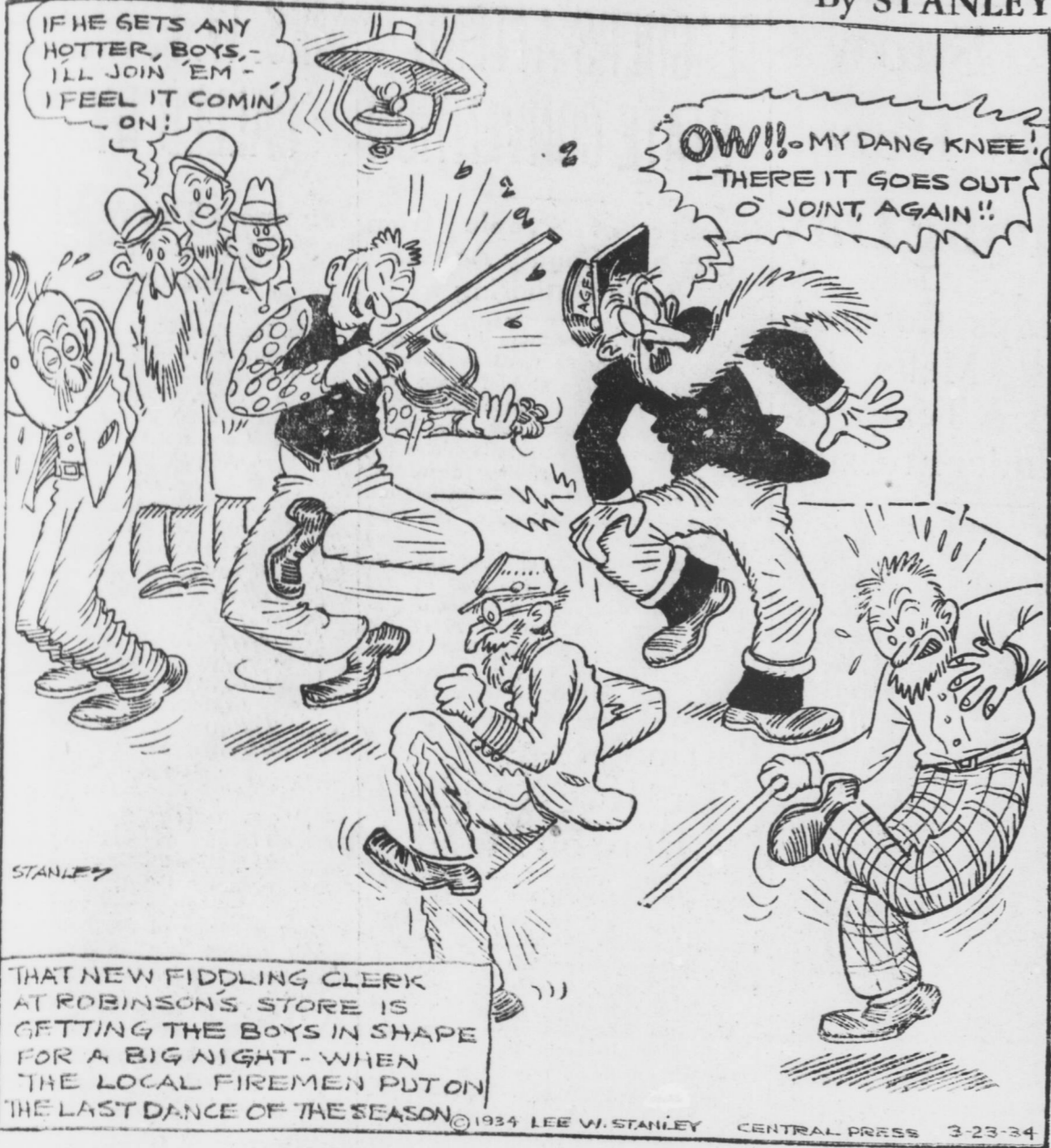
THAT NEW FIDDLING CLERK AT ROBINSON'S STORE IS GETTING THE BOYS IN SHAPE FOR A BIG NIGHT - WHEN THE LOCAL FIREMEN PUT ON THE LAST DANCE OF THE SEASON.