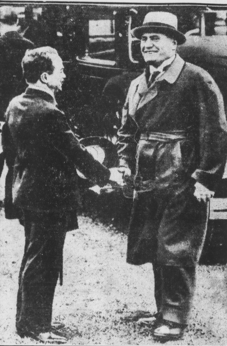
Chancellor Engelbert Dollfuss, Austria's Napoleonic premier, seals his understanding with Premier Benito Mussolini of Italy with a handshake at a cavalry show near Rome, after signing of new three-cornered peace pact in which Hungary also plays a part. In consequence, European peace now rests largely in these two men's hands.