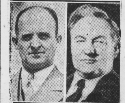
Sanford MacNider Jas. E. Watson Following resignation of Everett Sanders as chairman of the Republican National Committee, these G. O. P. stalwarts are being mentioned as in line for the post. Lowden is former Governor of Illinois; Dickinson, Senator from Iowa; MacNider, former commander of the American Legion is an Iowan and Watson was Senator from Indiana and G. O. P. leader in the Senate.

Charged With Fraudulent Use of Mails and Violations of Federal Bankruptcy Act