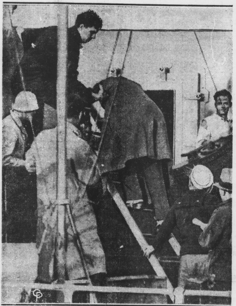
Aided by a sailor, Samuel Insull, former Chicago utilities czar, climbs down the ladder of the S. S. Exilona, which brought him from Turkey, as he was transferred to a government cutter off the Ambrose Light outside New York Harbor. Arrangements for transportation of prisoner to Chicago were veiled in secrecy.