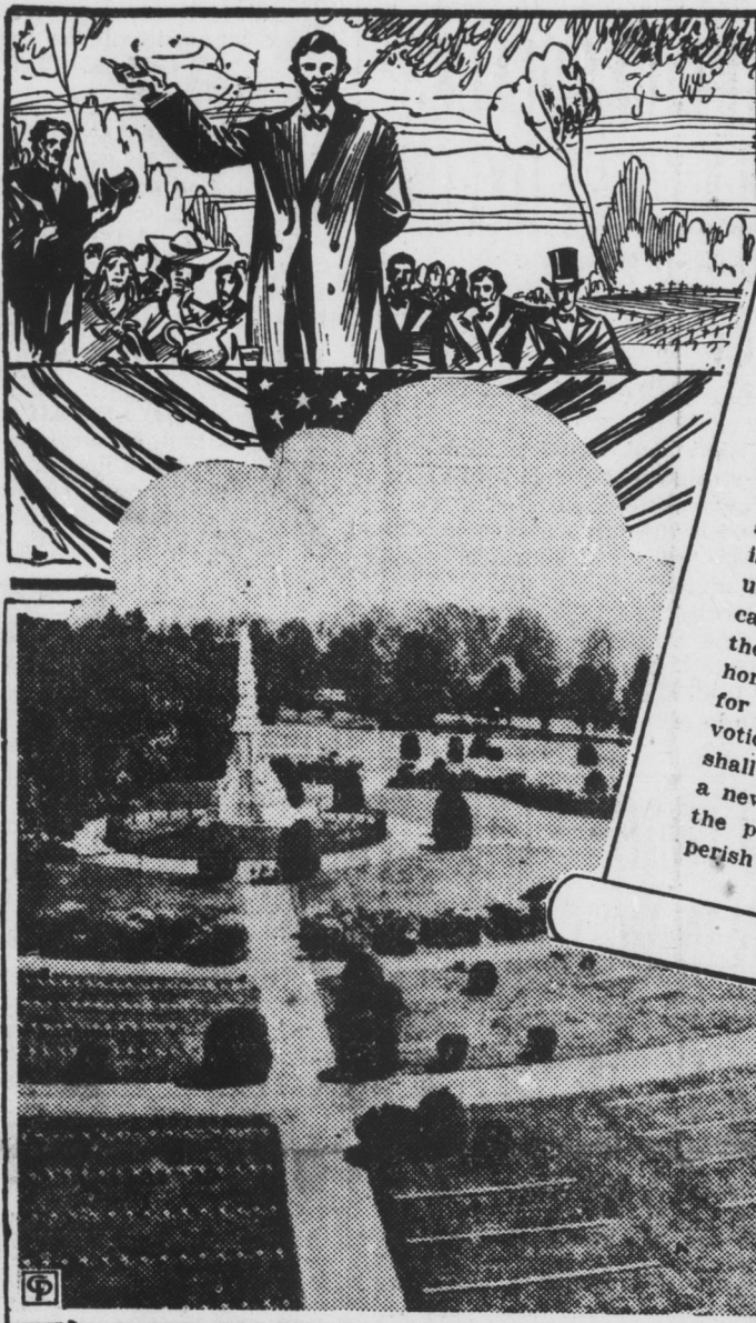
View of cemetery at Gettysburg.

Following the custom of presidents in the past, President Roosevelt will journey to Gettysburg, Pa., on May 30 and deliver an address in the observance of Memorial Day, commemorating the