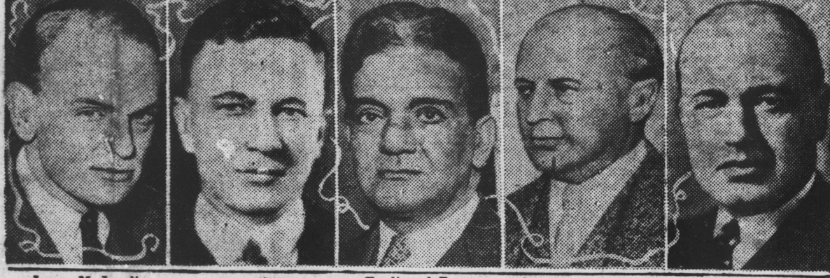
The men pictured above are slated to rule the stock exchanges in the nation, locations of which are shown in the map, as the Federal Securities Exchange Commission after July 1. Landis, a member of the Federal Trade Commission, was one of the framers of the act setting up the securities control; Pecora, New York lawyer, was the Senate's hired inquisitor into Wall St. practices; Matthews, a Wisconsin man, is also a member of the trade commission; Auchincloss and Witter are New York and San Francisco, respectively, investment bankers.