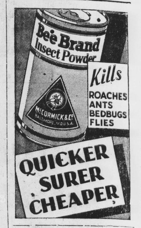
Buy Your Lot, Build Your "Home