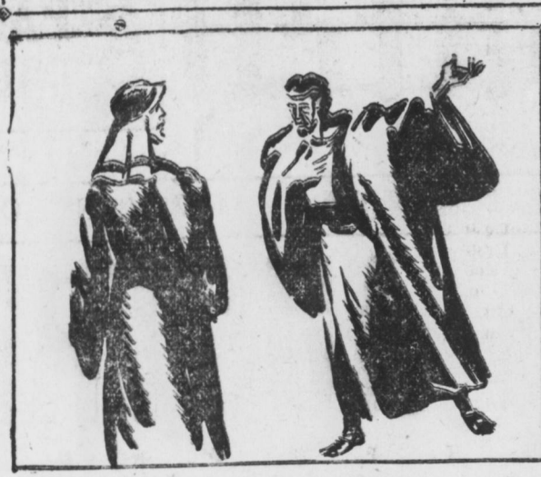
Ahab, the most wicked of all Israel's kings, and Jehoshaphat, one of the best of Judah's kings, came together at Samaria to plan an attack upon the armies of Syria. Jehoshaphat was trying to be a good neighbor to the wicked Ahab