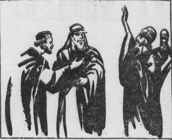
The good king suggested that they inquire the will of God in the matter. So Ahab got 400 of his wicked prophets to say they should go. But Jehoshaphat asked for a true prophet of God and Micaiah was brought whom Ahab hated because he always told the truth.