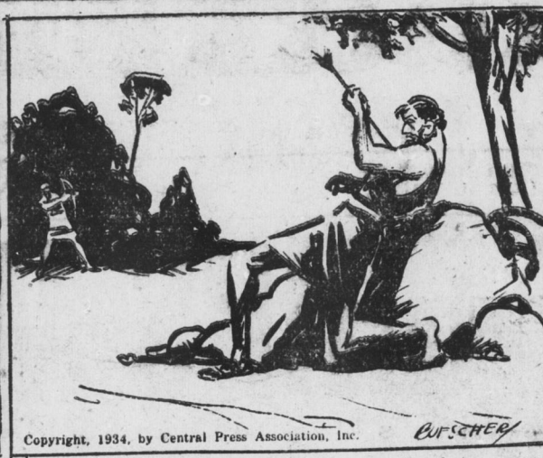
In the battle Ahab tricked Jehoshaphat into wearing his royal robes while he wore common clothes to escape danger. But some unnamed soldier shot an arrow without aiming at anything and God guided it to strike Ahab and kill him. Those who fight against God and truth meet justice (GOLDEN TEXT-I Kings 22:14)