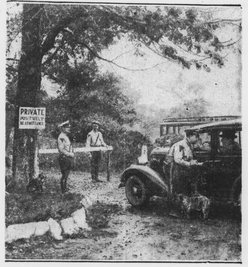
While detectives search anew for evidence in Lindbergh kidnaping at the Hopewell, N. J., estate formerly occupied by the aviator, New Jersey state policemen are maintaining extra guard and questioning all visitors.