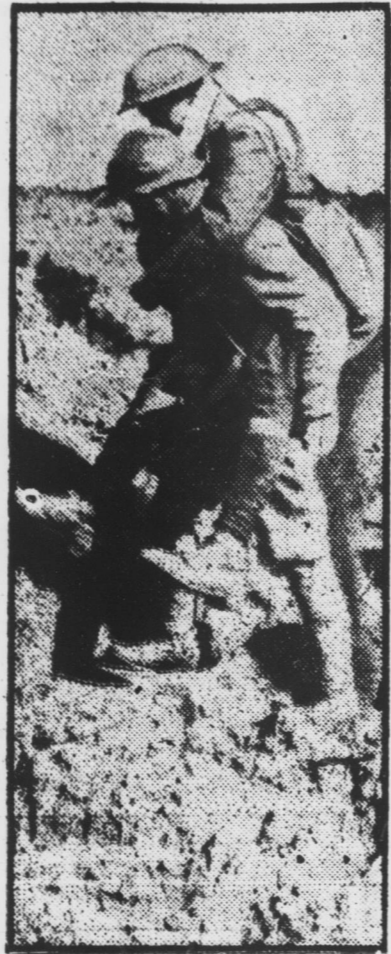
"The blind man and the lame man"

20 Years Ago Today: French Alpine troops captured Tete-de-Viols hill, commanding the Marien-aux-Mines pass into the Vosges, after 12 days of savage fighting.