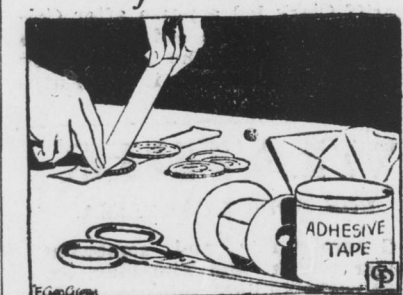
Adhesive tape may be used to hold coins together for ease in counting.