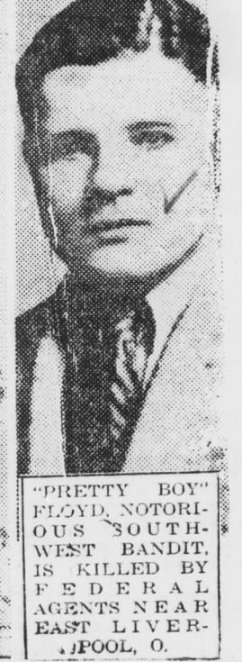
'PRETTY BOY' FLOYD, NOTORIOUS 'SOUTH-WEST' BANDIT, IS KILLED BY FEDERAL AGENTS NEAR EAST LIVERPOOL, O.