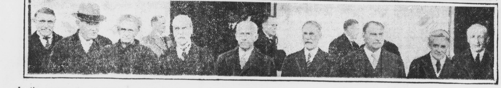
In the unpretentious building at right, the Department of Justice, Washington, the arguments were prepared with which the administration hoped to win from the Supreme Court a favorable decision in the most momentous issue presented to the body in decades, that, having to do with the legality of President Roosevelt's seizure of gold, voiding of gold contracts and devaluation of the dollar. A favorable decision would mean the declaration by the Court of a New Deal in the same year it has a new deal itself, with removal to the new building shown at left, on which is graven, "Justice the Guardian of Liberty." Indications of new liberalism in thought are being given by the chief justice, Charles Evans Hughes (left), once a Republican conservative. Members of the court are seen below at the White House for an official call on the President whose acts they are now asked to approve. Left to right: Justices Roberts, Butler, Brandeis, Hughes, Van Devanter, Sutherland, Stone, Cardozo, McReynolds.