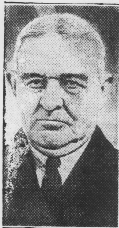
John Barton Payne

Washington, Jan. 24.—(AP)—Just as his followers were coping with another flood, Judge John Barton Payne, head of the American Red Cross, died early today.