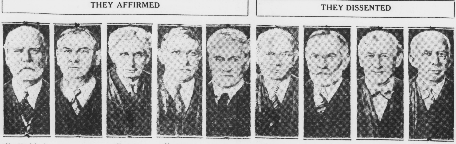
Mr. Chief Justice Hughes Mr. Justice Stone Mr. Justice Brandeis Mr. Justice Roberts Mr. Justice Cardozo Mr. Justice Butler Mr. Justice Sutherland Mr. Justice McReynolds Mr. Justice Van Devanter